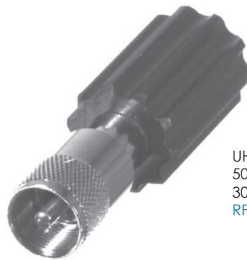
UHF Dummy Load 50 ohm, 30 watt, 300 MHz RFU-551