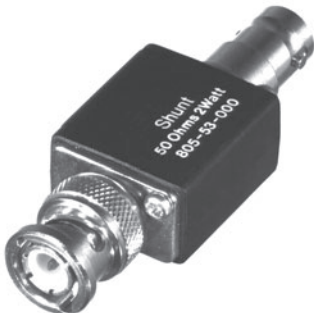
BNC Shunt 50 ohm, 2 watt RFA-4055