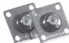
FIG. 39 PT-4010-002