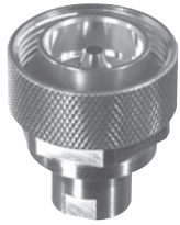
FIG. 31 PT-4000-119