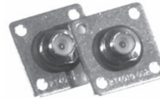
FIG. 39 PT-4010-002