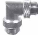
FIG. 18 PT-4000-026