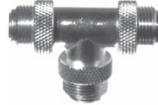
FIG. 19 PT-4000-027