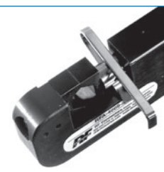
Lower die removal